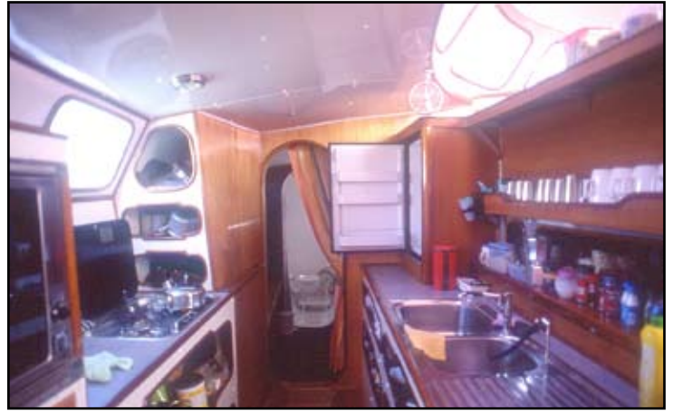
A convenient and well-stocked galley is located in the port (left) hull and is fitted with a gas stove and an oven/grill.