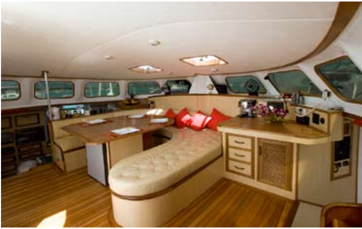
The saloon is spacious with a u-shaped, light-tinted leather settee set around a central table. 9 Persons can sit here for breakfast, lunch or dinner,